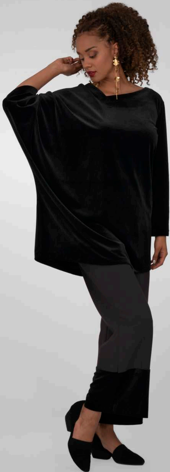
VAPOR TUNIC Velvet: Black Style #89501