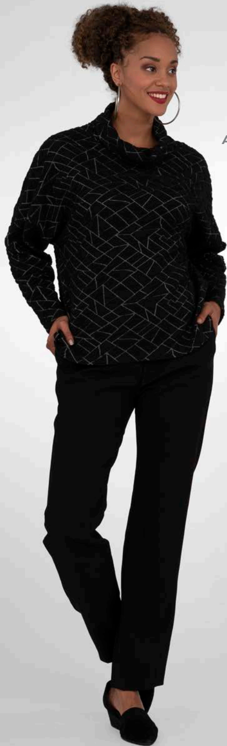
BALSA TOP Angles Knit: Multi Style #82846