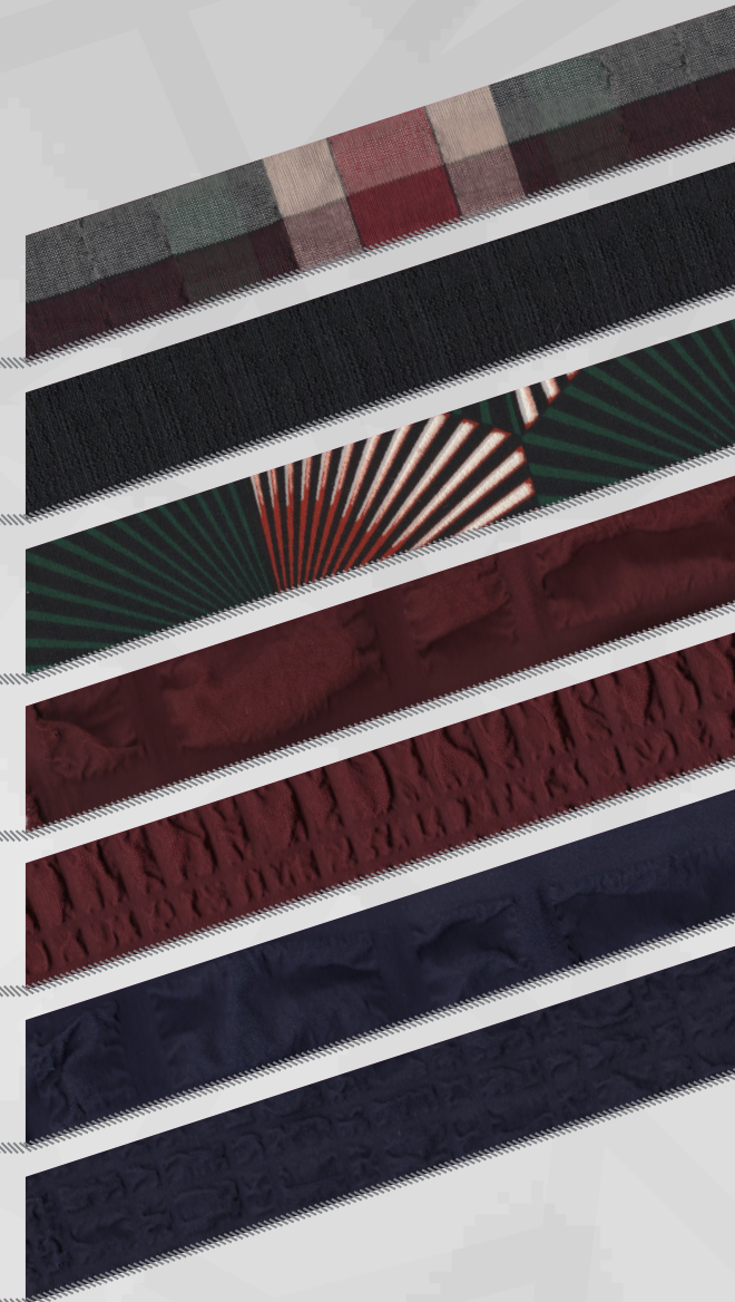
Large Pucker: Navy