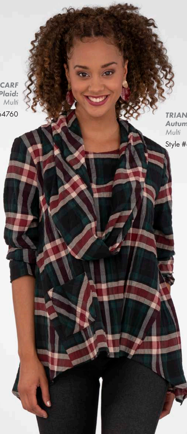
TRIANGLE TOP Autumn Plaid: Multi Style #64759