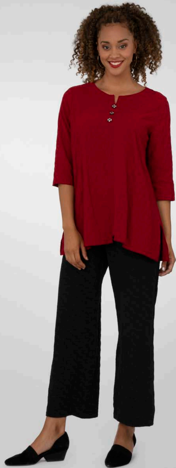
RADIO TOP Diamond Knit: Red Style #6431