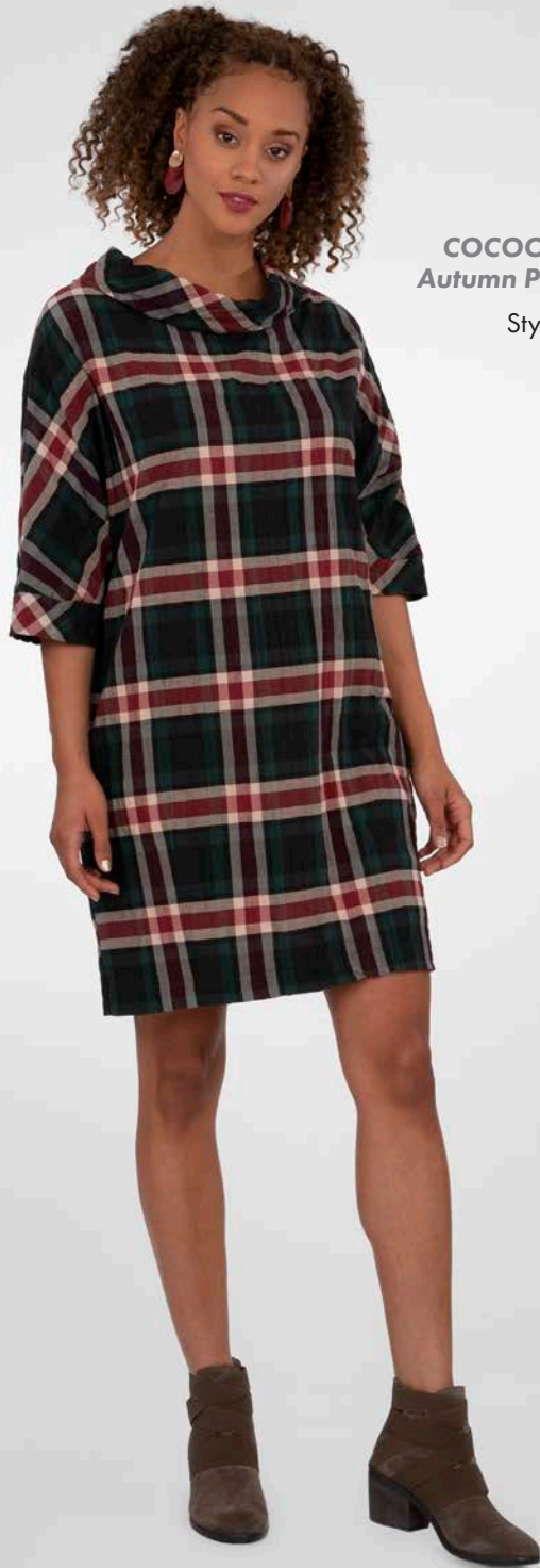
COCOON DRESS Autumn Plaid: Multi Style #64761