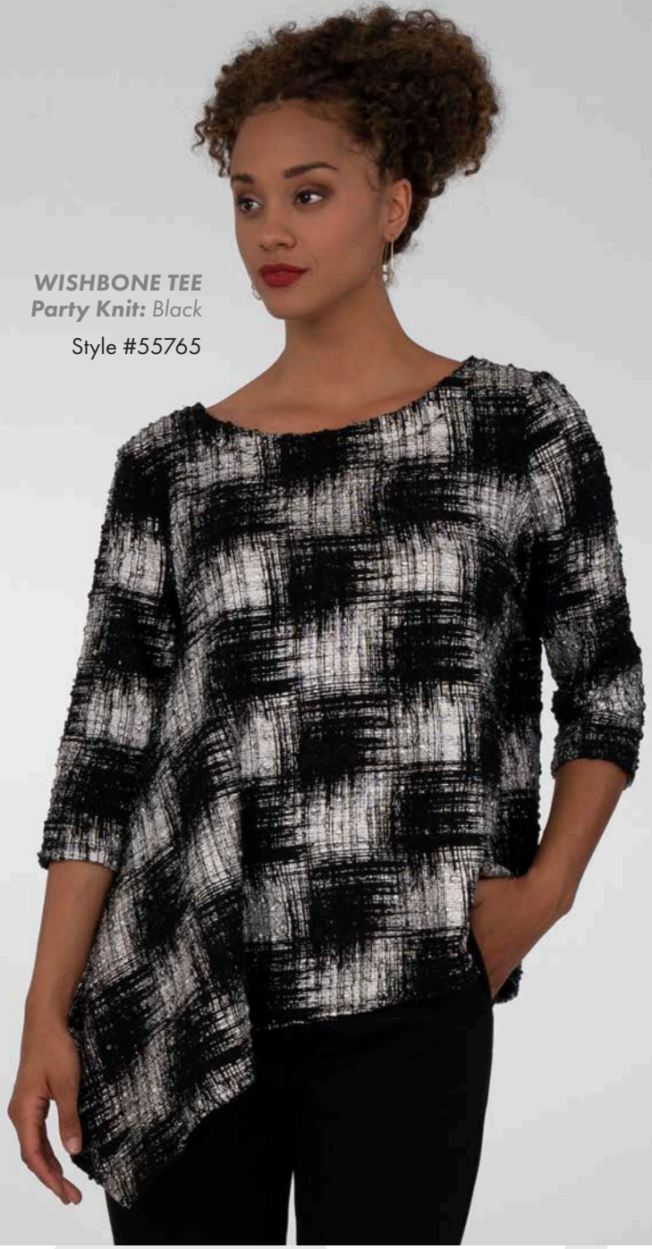
WISHBONE TEE Party Knit: Black Style #55765