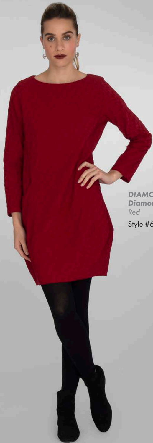
DIAMOND TUNIC Diamond Knit: Red Style #6429