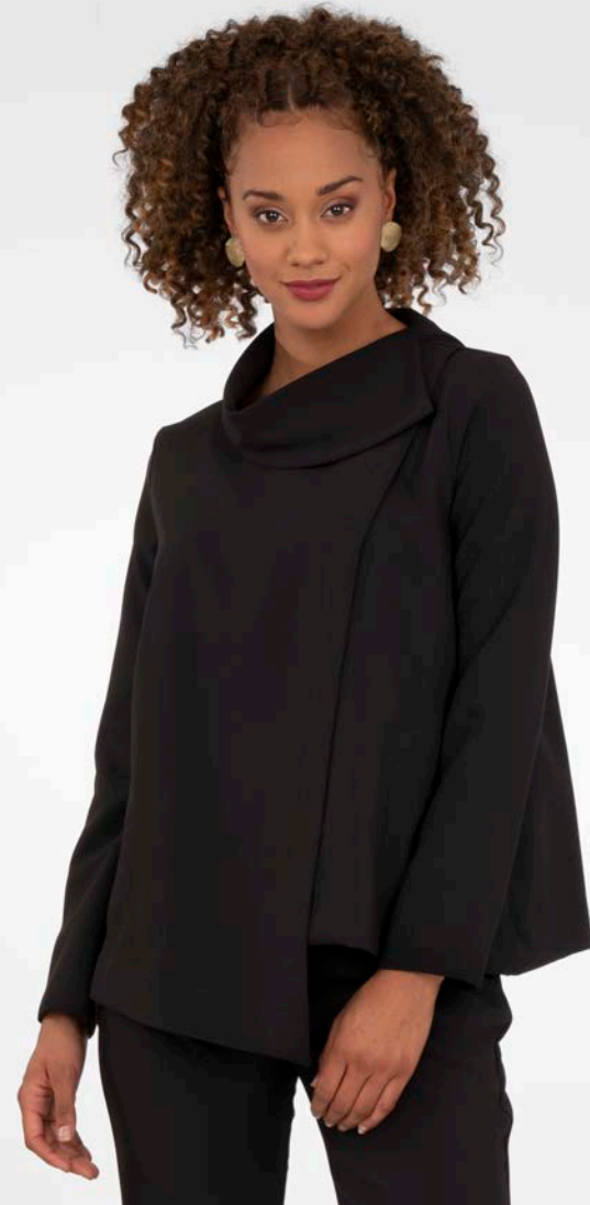
SET POINT TOP Roma: Black Style #63008