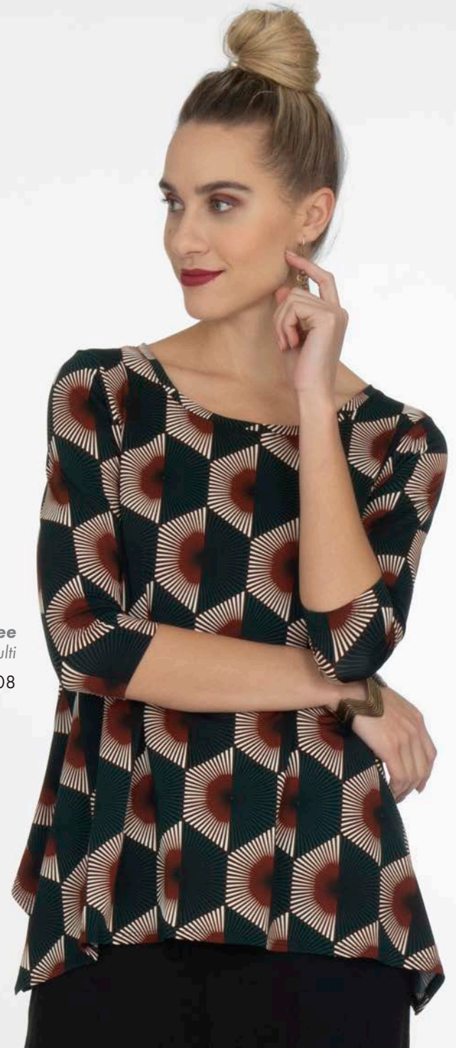
Salsa Tee Fans: Multi Style #72308