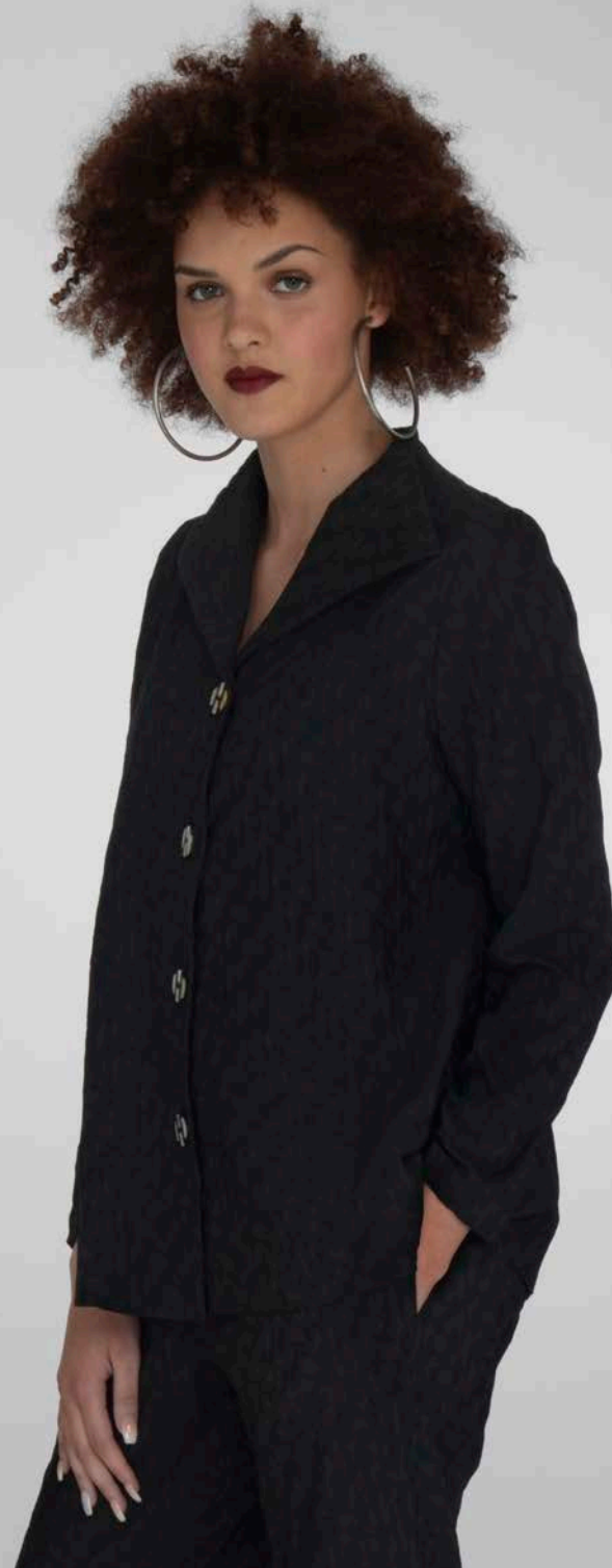
THYME BLOUSE Diamond Knit: Black Style #6427