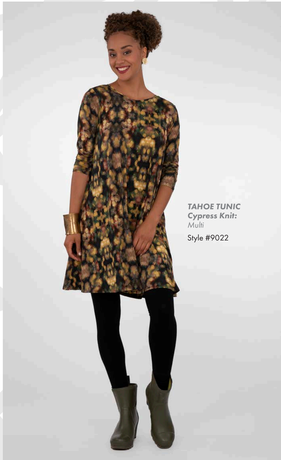
TAHOE TUNIC Cypress Knit: Multi Style #9022