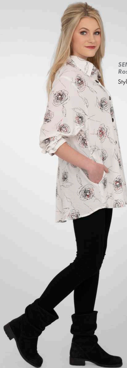
SENTIMENT JACKET Rose: Multi Style #4902