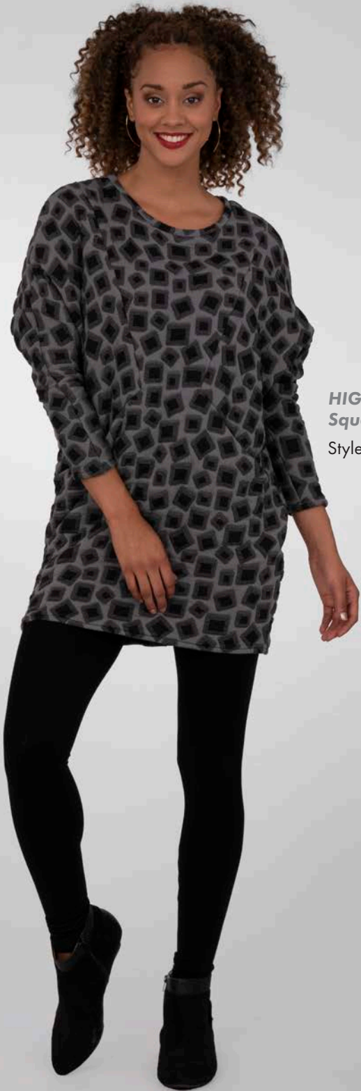
HIGHWATT TUNIC Square Knit: Multi Style #82854