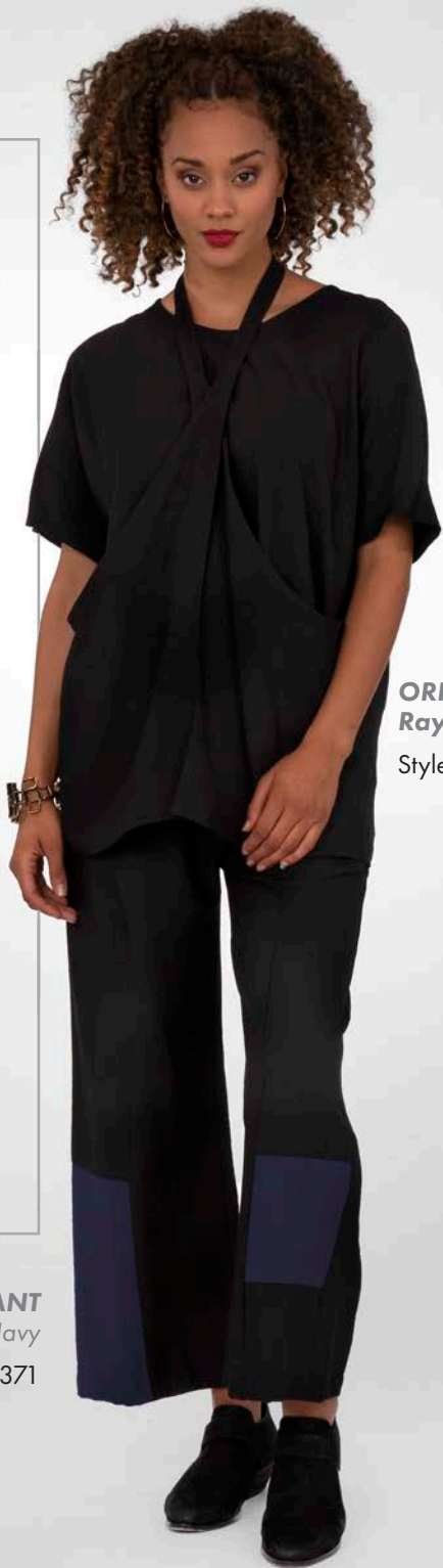
ORIGAMI TOP Rayon: Black Style #4370