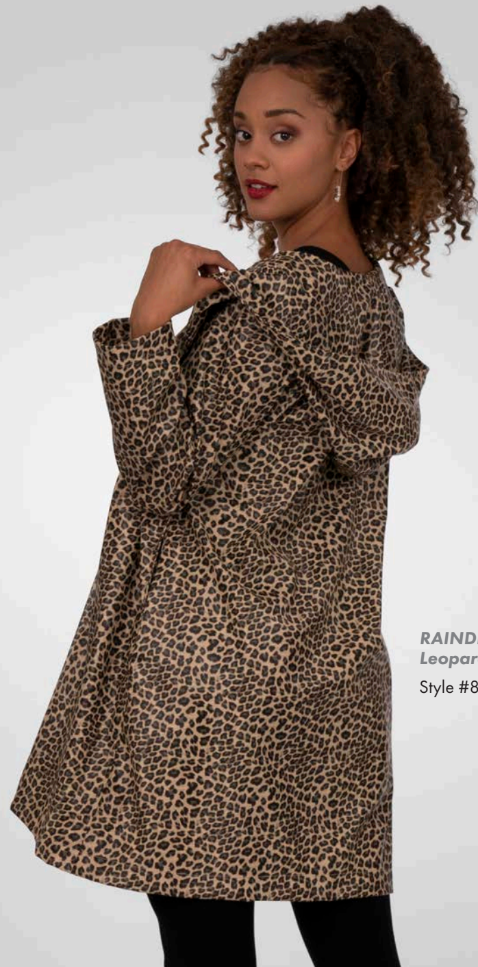
RAINDROP COAT Leopard: Multi Style #89542