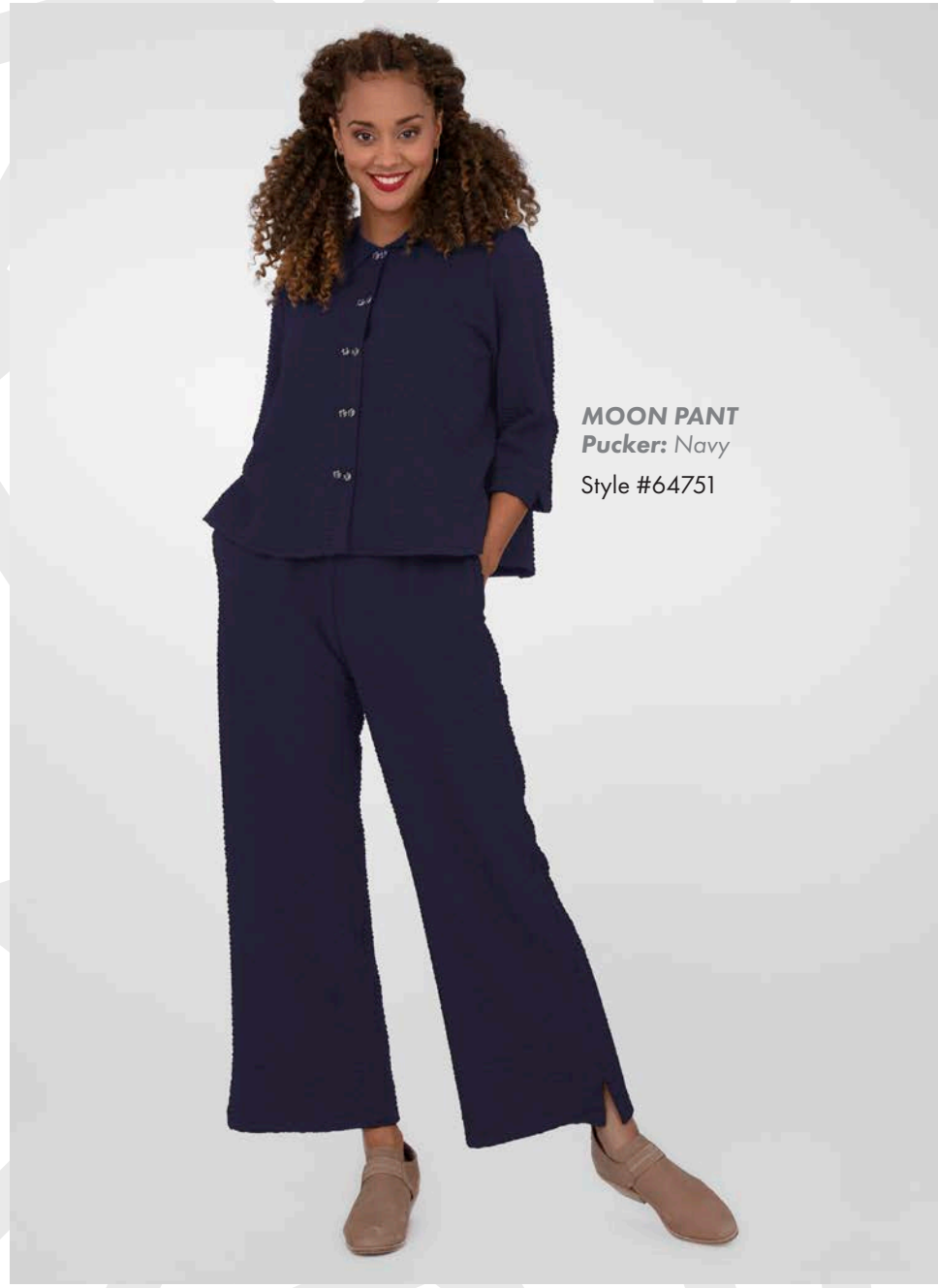
MOON PANT Pucker: Navy Style #64751