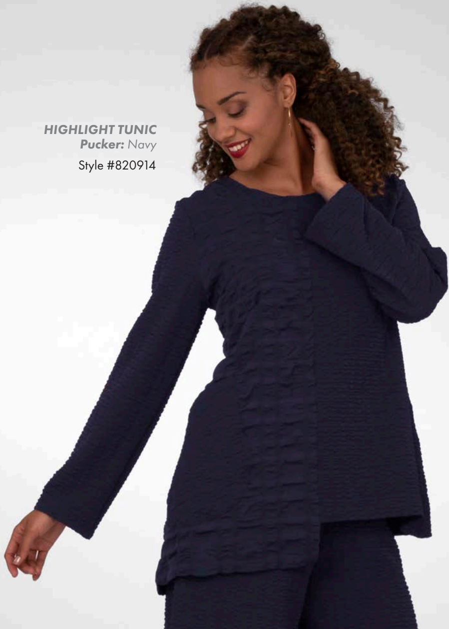
HIGHLIGHT TUNIC Pucker: Navy Style #820914