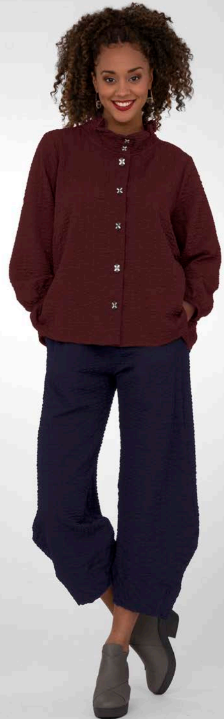
WREATH JACKET Pucker: Merlot Style #64745