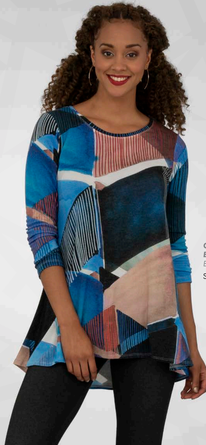
GEMMA TOP Blue Bayou: Blue Multi Style #55826

Watercolor blues in a bold, abstract print coordinate back to earthy Ginger and Midnight solid separates.