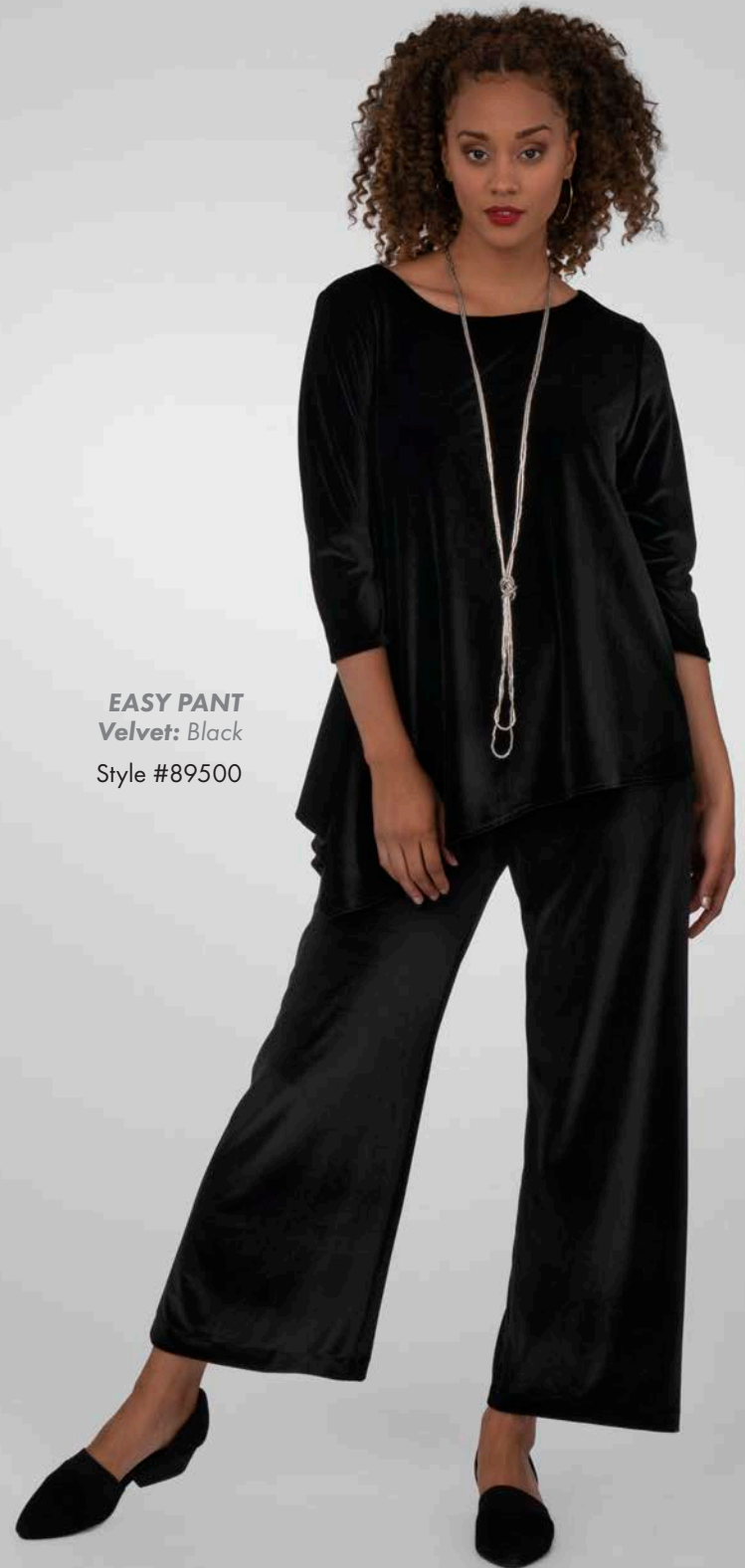
EASY PANT Velvet: Black Style #89500