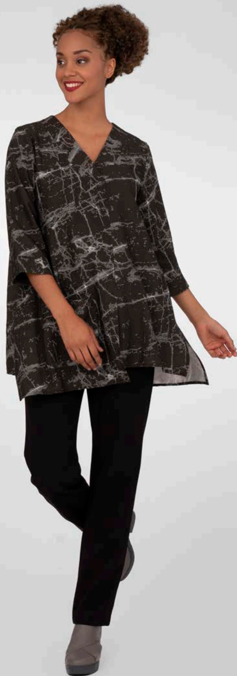
REEF TUNIC Rayon: Black Marble Style #4327