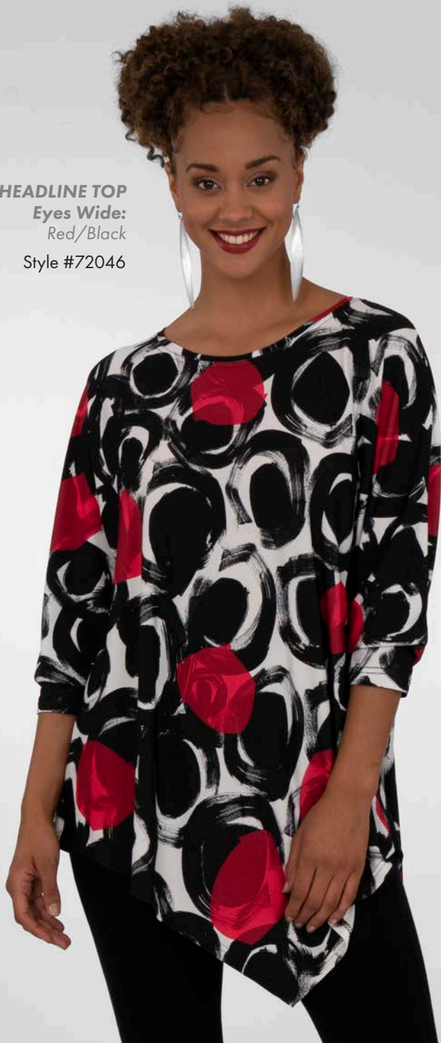
HEADLINE TOP Eyes Wide: Red/Black Style #72046