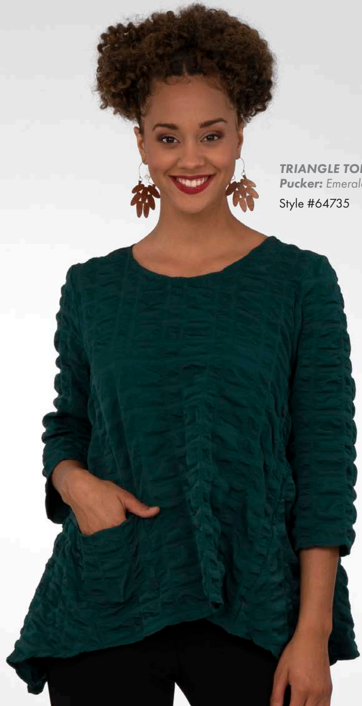
TRIANGLE TOP Pucker: Emerald Style #64735