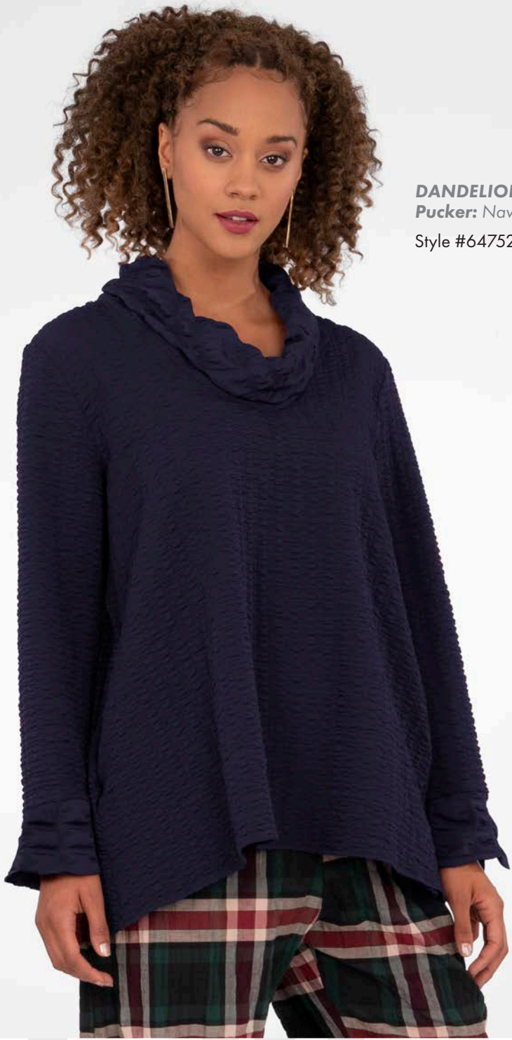
DANDELION TOP Pucker: Navy Style #64752