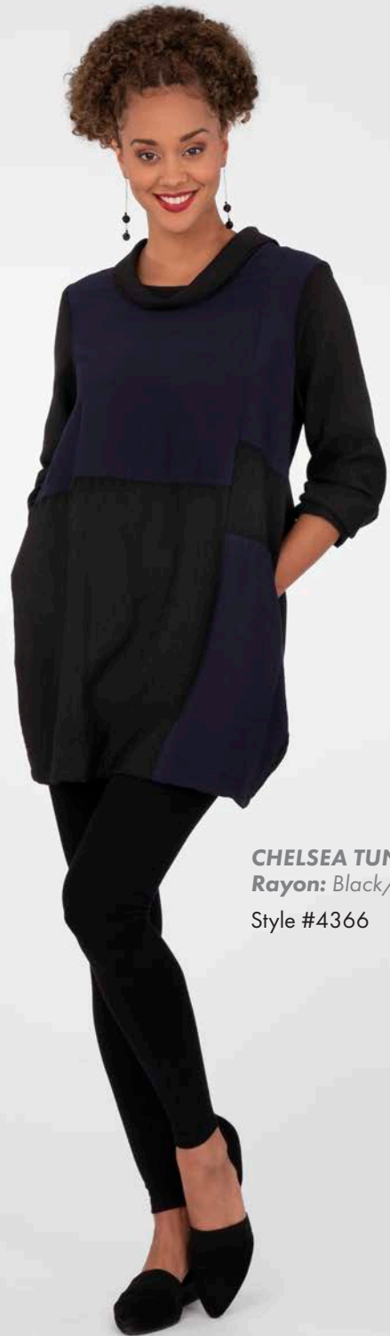
CHELSEA TUNIC Rayon: Black/Navy Style #4366